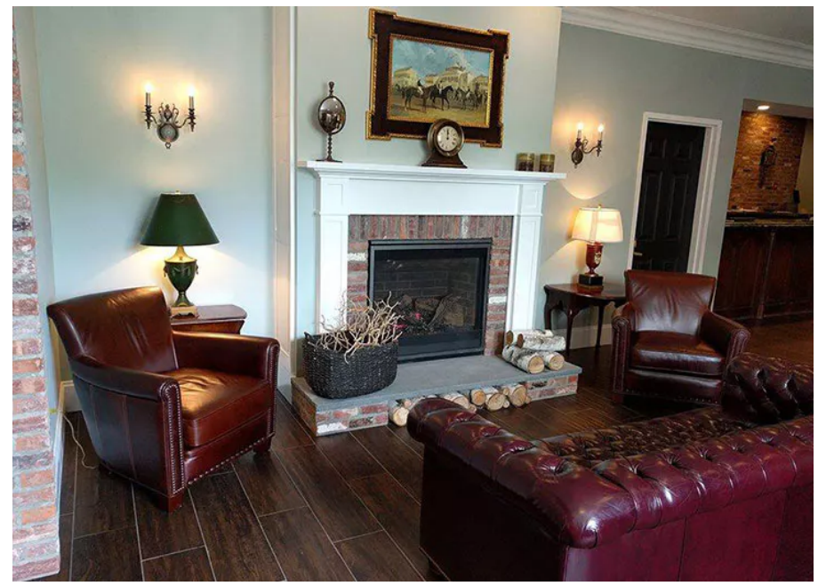
RELATED: YOUR NEXT WEEKEND ESCAPE: BUCKS COUNTY, PENNSYLVANIA

While certain parts of the Hudson Valley are so well trodden they can feel a little like Williamsburg North, venture a little farther and you'll encounter another world entirely. Troy, a little gem outside of Albany, is well worth the three-hour drive (or train ride plus short cab ride) for its mix of Empire State history, gorgeously preserved architecture and a revitalized dining scene. Here's how to spend a weekend exploring the Capital District town.